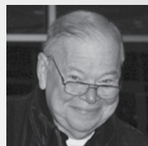
Taught by Jim Armstrong

First Session: Sunday, September 27 MC 122 | 11:15 AM