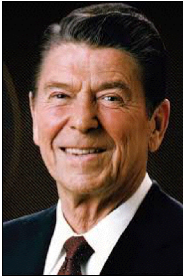
Ronald Reagan Sports Announcer Actor Politician