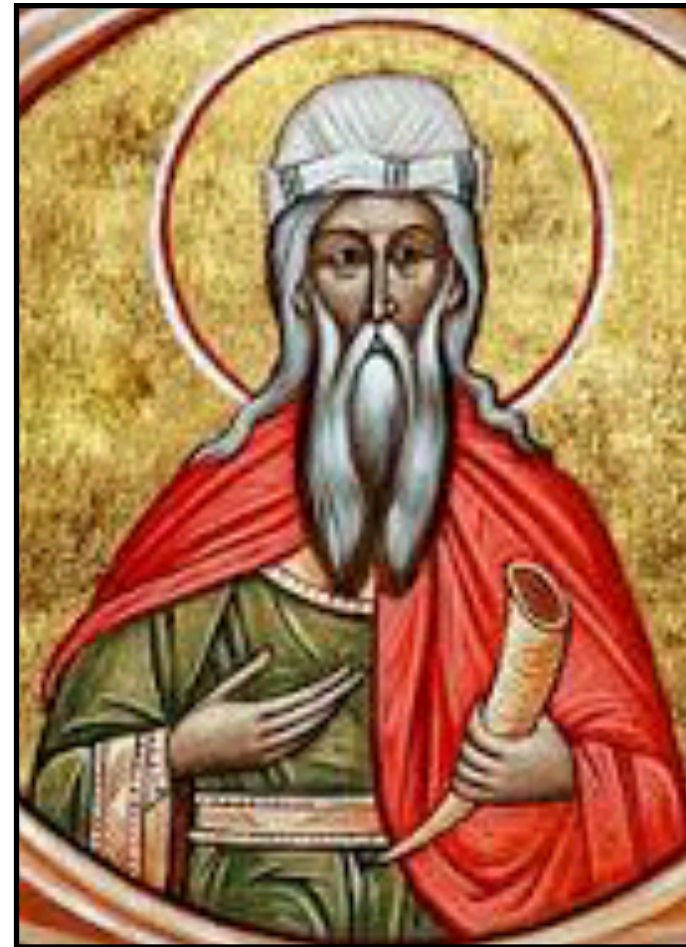
Samuel Judge Prophet